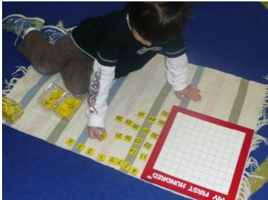
Liam—the 100's board takes lots of concentration.