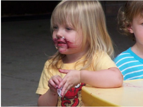
...we sang Happy Birthday and ate yummy cake...