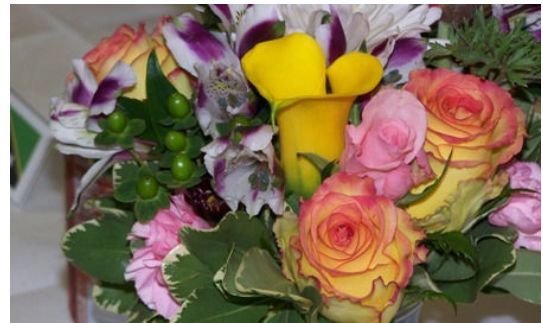
...were honored by the parents with a special luncheon and gifts....