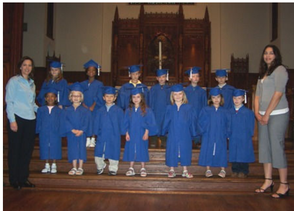
...watched our Kindergarten Class graduate...