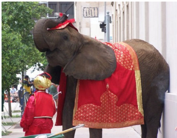
...saw an elephant filming a German cell phone commercial...