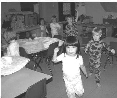
Glow sticks, pj's, music, and playing outside in the dark, Auction night was more fun here than for our parents at the