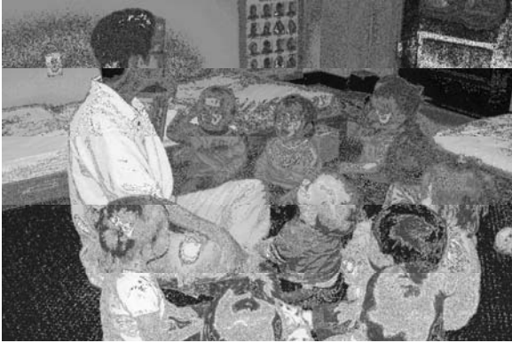
Movement I loves to look at pictures of animals and try to make sounds like them.