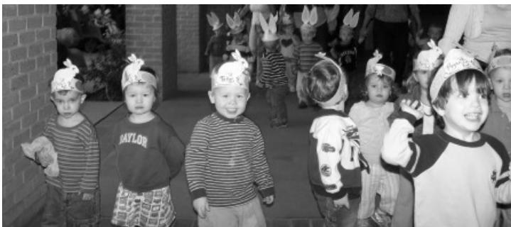
Toddler I is ready to parade around and wave to all the families watching.