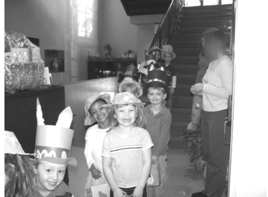
"Look at me", "No, look at me", "Here I am". Kindergarten is not shy!