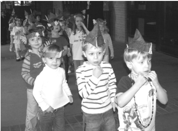
"These strings are too tight"