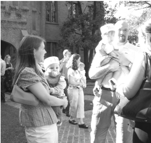
Mommies and Daddies had fun at