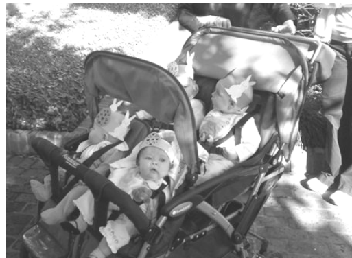
Nursery I enjoys the first of many Hat